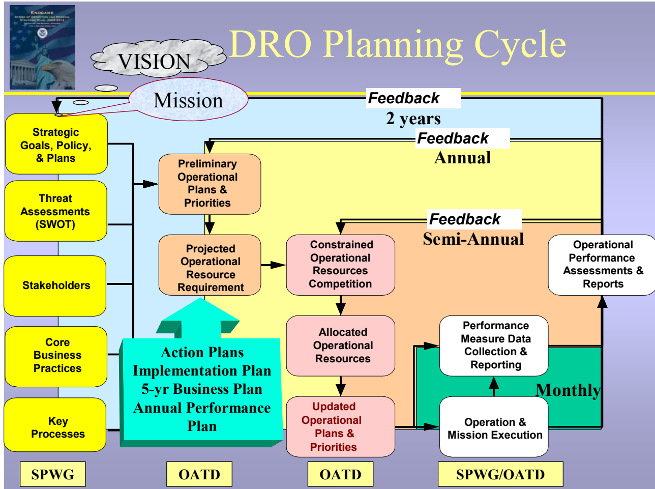
Figure 4. DRO Planning Cycle