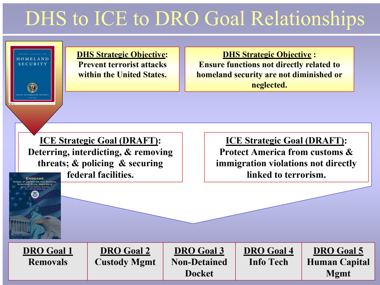
Figure 3. Relationship between the Department of Homeland Security, Immigration and Customs Enforcement, and Detention and Removal Operations

is, DRO is responsible for the detention, processing and removal of aliens apprehended by other immigration and law enforcement partners. DRO does not, however, have control over these enforcement efforts and must rely on its partners to provide estimated service and support needs and resource requirements.