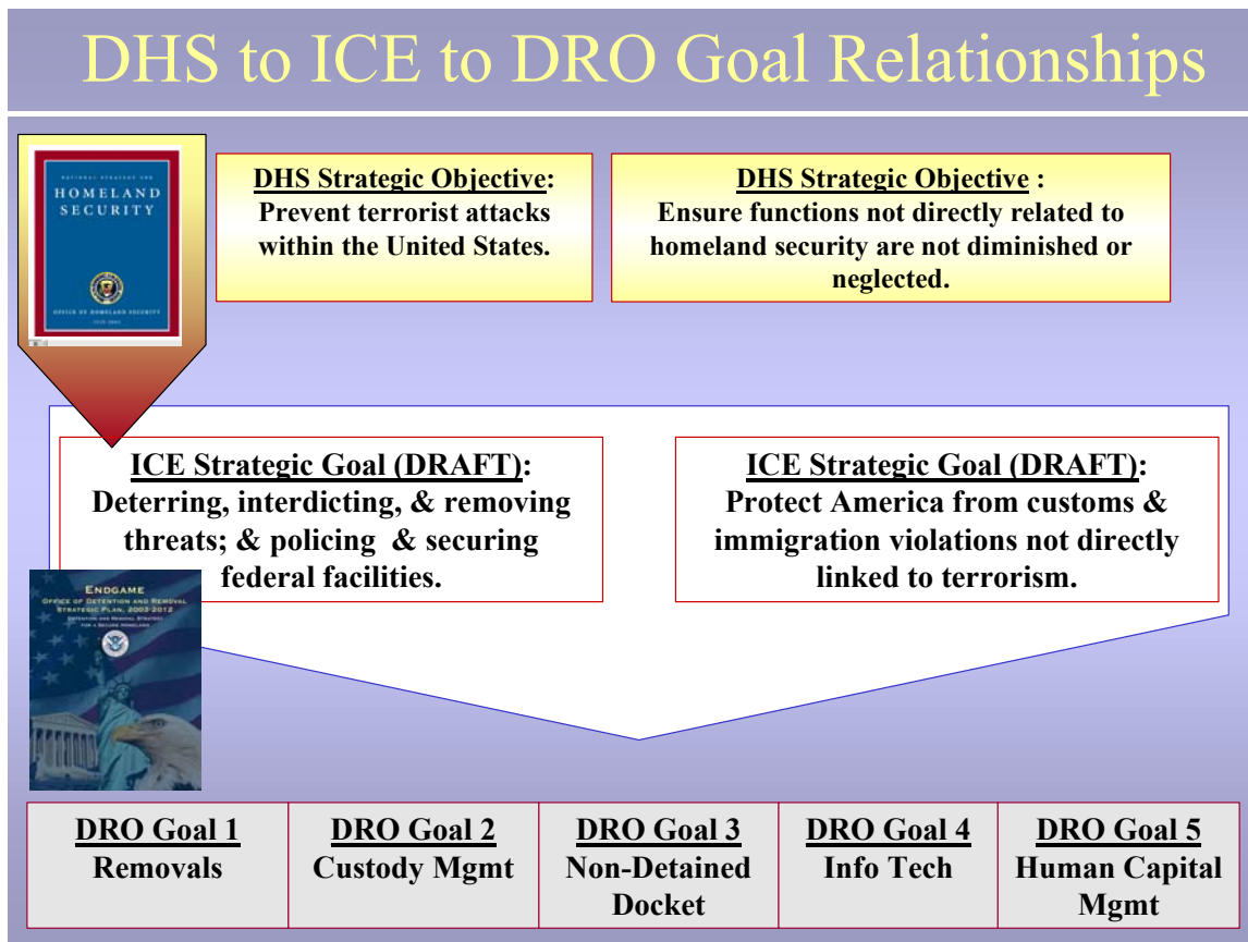
Figure 1. Relationship between DRO, ICE and DHS Strategic Goals and Objectives

When implemented to its fullest, this plan will serve as the platform from which strategies will be initiated, partnerships will be built, and innovation for continued process improvement will be fostered. This vision will be realized, and the mission will be accomplished, only through the collective and collaborative efforts of all DRO employees. DRO employees (including officers, management, and staff) must encourage growth and improvement through the sharing of ideas and the integration of DRO core business functions with key processes, all critical elements of the immigration enforcement program.